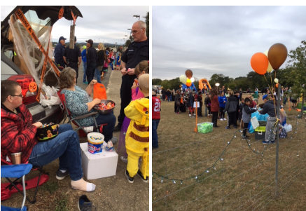
Halloween Light Night